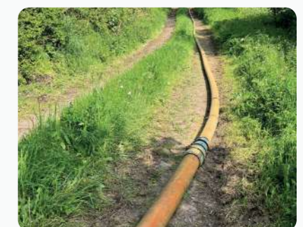
Oroflex 20 pipeline 5" to 4" Slurrykat stainless steel coupling adaptor