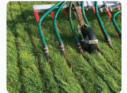
Trailing Shoe applying slurry in thick long grass