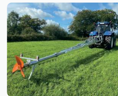
Maxi Slurry Mixer: Propeller Mixing Systems