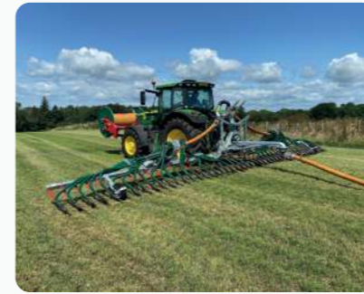
12m Premium Plus™ Trailing Shoe with Front Hose Reeler