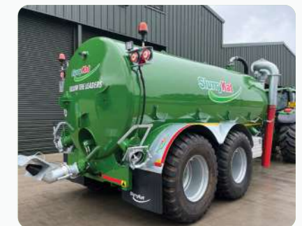
3500G/16m 3 Premium Plus™ Tanker c/w Deep Fill 8" Loading Arm with Integrated Turbo Pump and Internal Sand/Sediment Mixing System