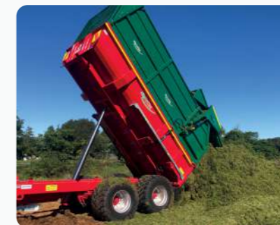
Silage Dump Trailer (SDT)