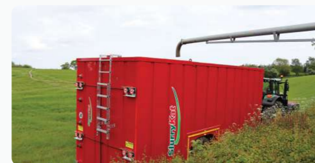
65m 3 Mobile Nurse Tank – delivered road ready & set up in under 5 minutes