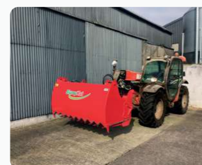
Shear grab made high tensile S355 steel & with Hardox 450 tines giving long life in high stress applications