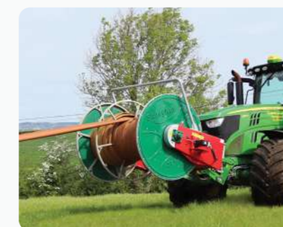
Front Reeler winding in 1000m hose