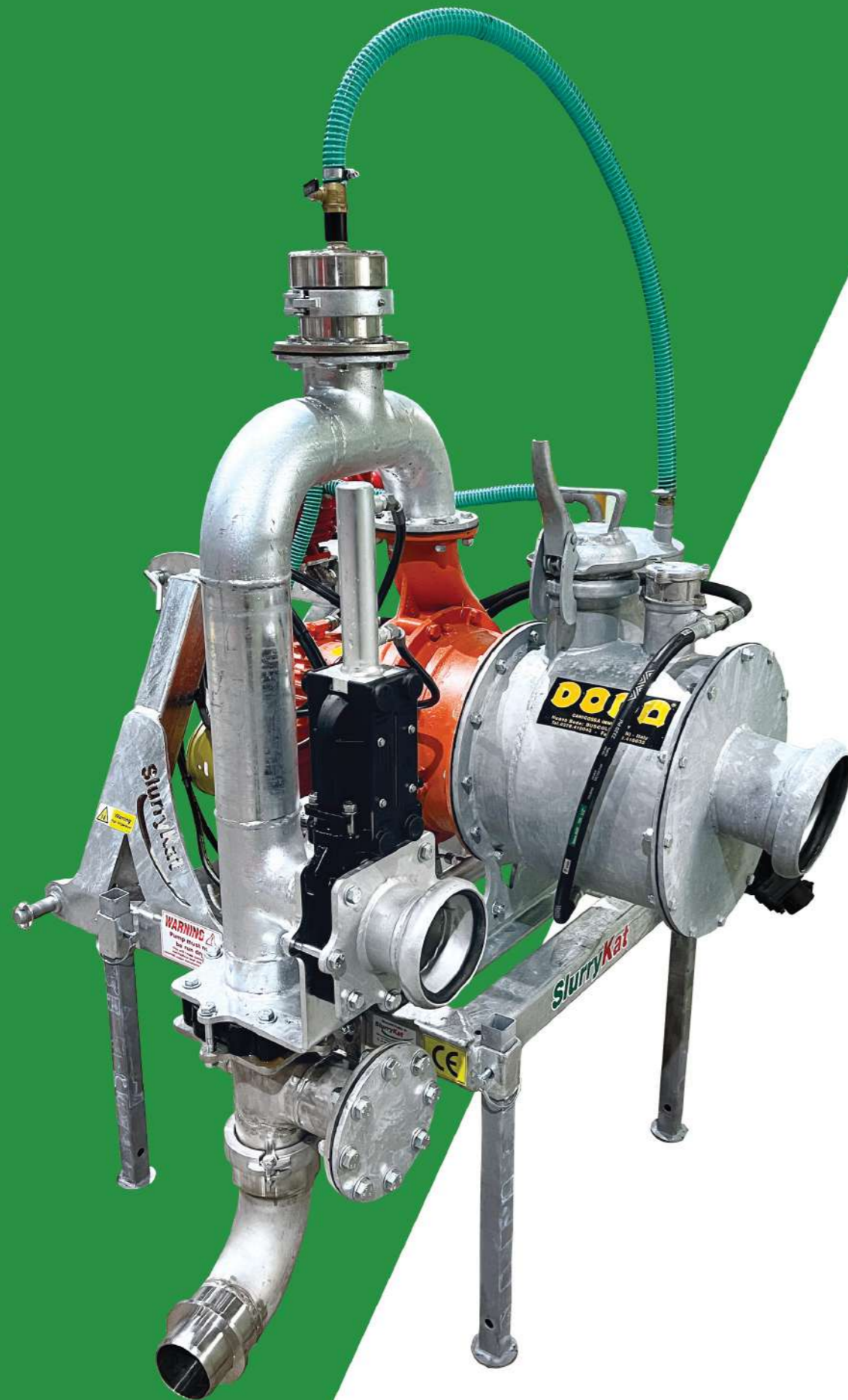
AFI HD35 Slurry Pump