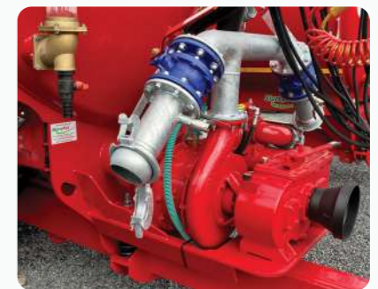
DODA® L35/Battioni Evo Dual Pump Set – discharges at 12 bar/250m 3 per hour feeding an umbilical system