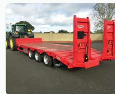
25T Low Loader Tri-Axle Model with Hydraulic ramps