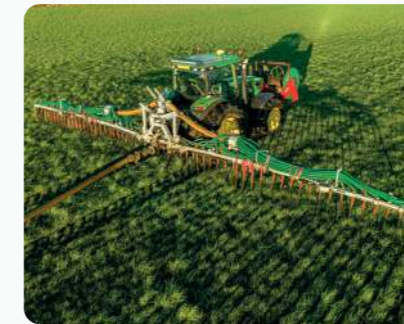
Premium Plus™ 15m Duo Dribble Bar