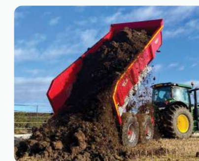
22 Tonne Half-pipe Dump Trailer