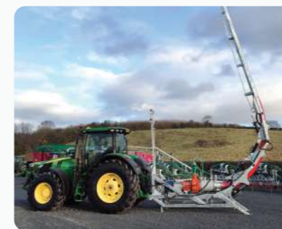
Skorpion Umbilical Pump Set