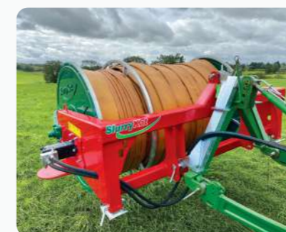
Optional quick attach galvanised adaptable A-frame

SlurryKat use Oroflex pipelines as they withstand the rigours of aggressive dragging and rough terrain and are designed for Sludge, Slurry & Irrigation. Available with the unique SlurryKat patented stainless steel couplings.