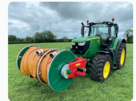
Front Mounted Hose Reeler with SlurryKat couplings