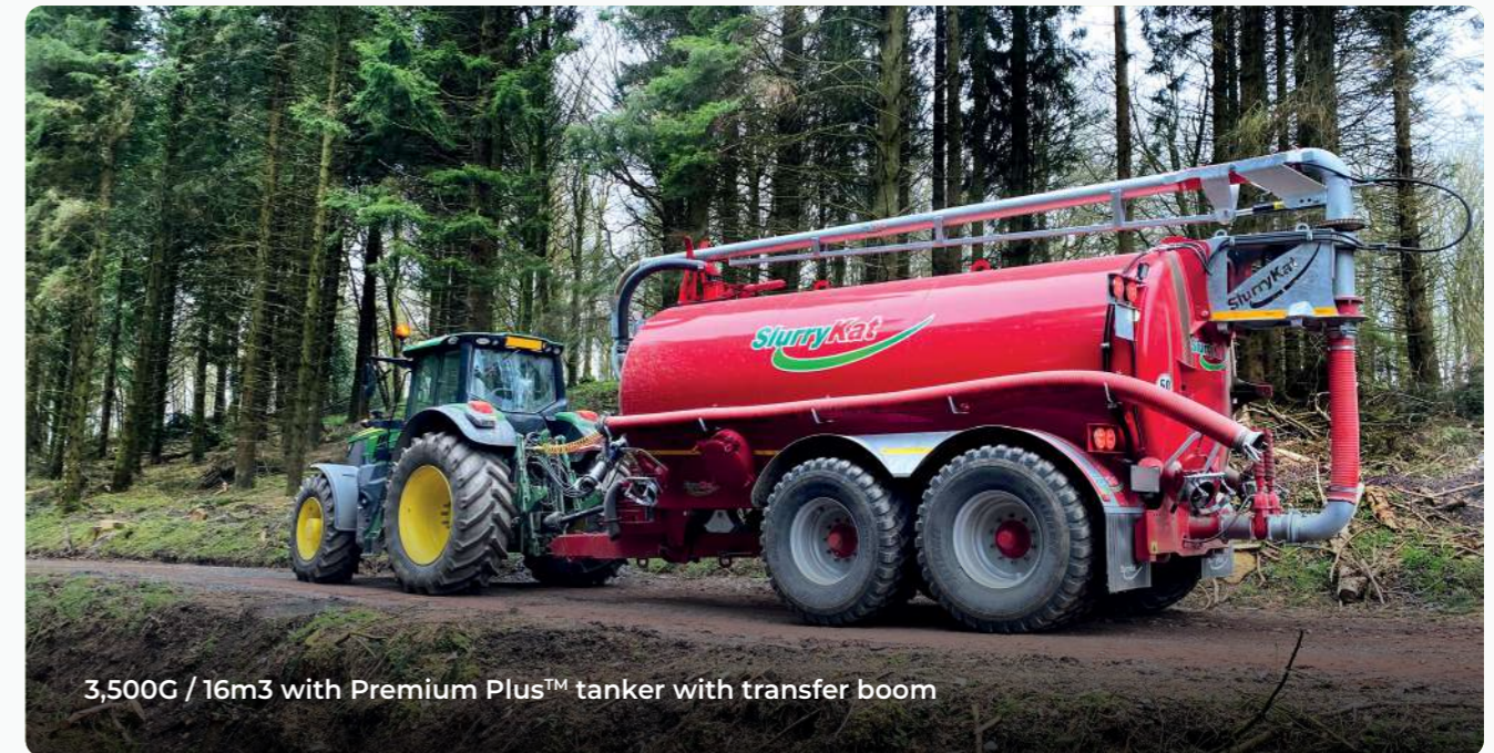
3,500G / 16m 3 with Premium Plus™ tanker with transfer boom