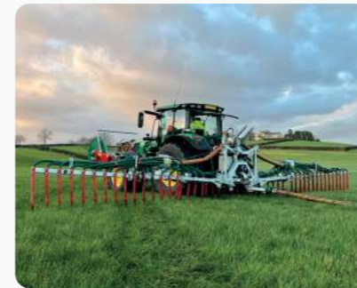
12m Premium Plus™ Duo Dribble Bar