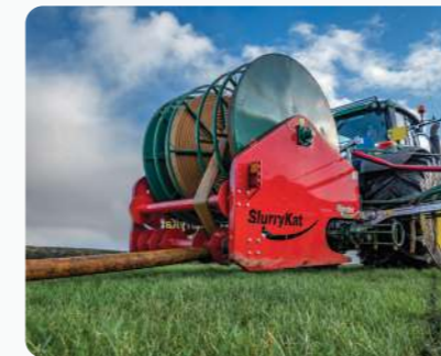
SlurryKat Bak-Pak™ system