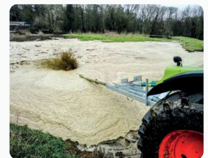
Models 7.5m - 12m