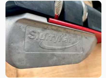
Trailing Shoe tip