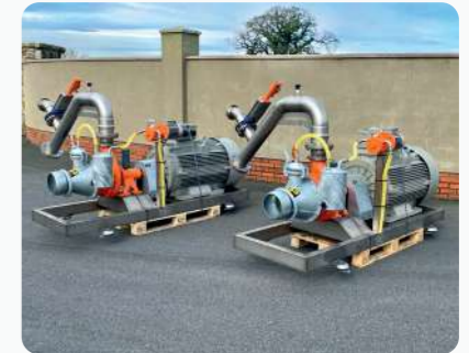
DODA® AFI L35 160KW motor c/w headland management system