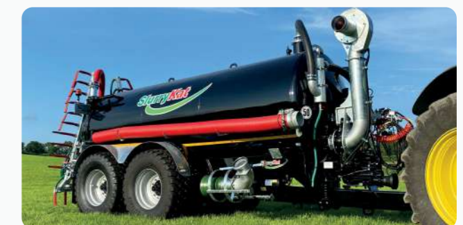
4,000G/18m 3 , rear steering, 8" autofill c/w turbo pump & dribble bar