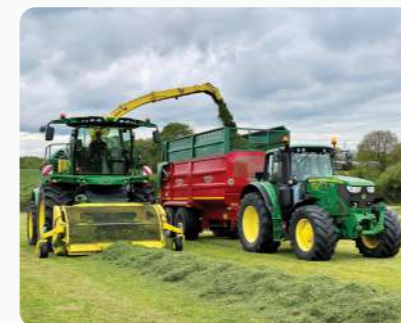
Proline Silage Trailer with flotation tyres