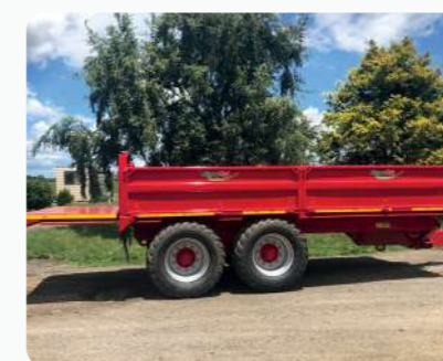
Dropside Trailer c/w 550/45R22.5 tyres & optional bale extension