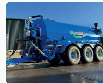
5,000G/22.5m 3 Tri-Axle, Front & Rear Steering Tanker