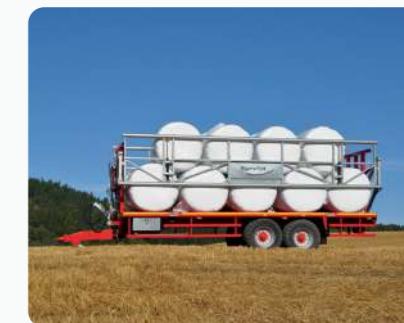
32 ft Flat Bed Trailer with hydraulic Bale Clamping system