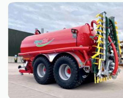
4,500G/20m 3 on 750/60R30.3 tyres