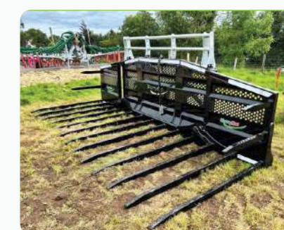
14ft Proline Silage Fork