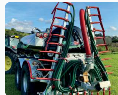
Slurry Tanker with Dribble Bar in transport position