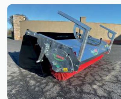
8 ft Sweeping Brush & Bucket