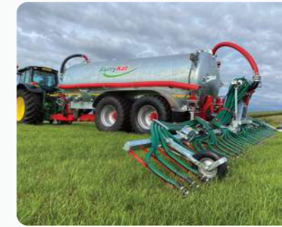
4000G/18m 3 galvanised Premium Plus™ tanker with 10m Trailing Shoe